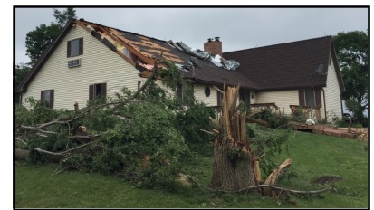
EXAMPLE OF DESTRUCTION